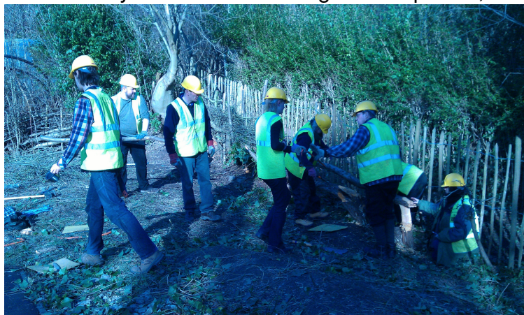
Volunteers helping lay hedge row by Urban Nature

A special thank you has to go to our partners, Groundwork Greater Nottingham and the Nottinghamshire Wildlife Trust who supplied willow, hazel and malus (crab apple) trees and assisted with the planting. Groundwork also provided 300 primrose and cowslip plants for use in the conservation areas, within the wildflower meadow adjacent to the Community Orchard and at Oliver's Heritage Gardens.